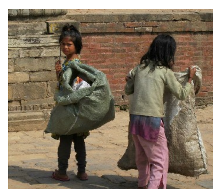
Girls collecting rubbish on the street in hopes of finding something they can sell.