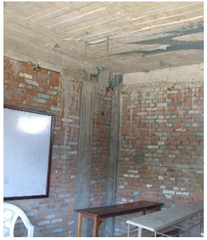
We are looking for a sponsor to fund repairs at the local school.

I am disappointed in the new school our children attend. The planned and promised renovation projects have not been completed. The classrooms are very depressing with crumbling brick walls, bare light bulbs, small and crowded benches, and worst of all, no door or window