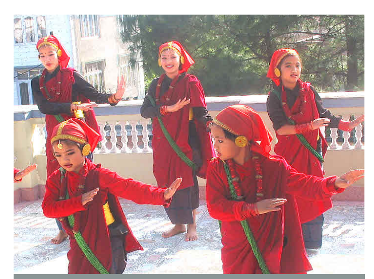
The Ghar Sita Mutu girls surprised Beverly on her birthday with a dance performance in traditional costumes, rented for the occasion.

The day starts at six with a yoga class for the children in the library followed by hot milk and study for thirty minutes. The children get dressed for school and then eat a lunch of rice, dahl and vegetables at ten to eight. They leave for the fifteen minute walk to school at 8:15.