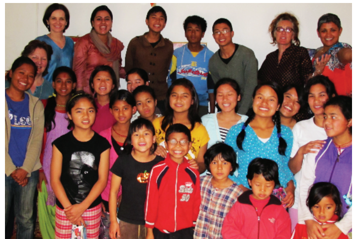
GSM family and friends.

fundraising both in Nepal and New York. If there ever was a time to contribute to GSM in any way, it is now. No matter what you can do, large or small, your help is always appreciated. Letters of encouragement and suggestions are always welcome, as are donations. We need volunteers to help in our New York office to write grants and help with fundraising events and